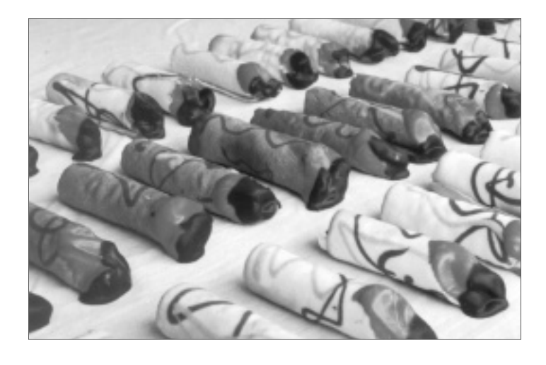
the tapeworm foundry, as baked by St Ephanie, Queen of Tarts